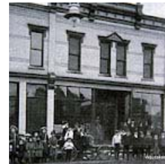
Koltes Lumber, built in 1898