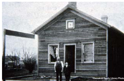
First school in Waunakee. It was later moved and turned into Simon Kirsches's (pictured) shoe repair shop.