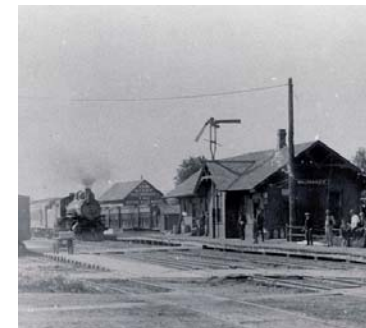
Steam Engine—Waunakee Train Depot